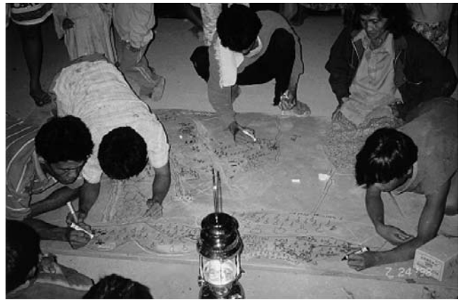
Figure 2. Villagers in Mindanao, Philippines, Preparing a Resource Distribution Sketch Map

More sophisticated methods of participatory 2- or 3-dimensional scale mapping aim at generating georeferenced data and depend on a disciplined use of selected symbols and colours for depicting desired features (Figure 3).