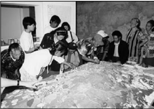
Figure 10 . Elders Locating Sacred Areas in Mt. Pulag, Cordillera, Philippines, 1999

The definition and translation of each legend into vernacular required thorough discussion and levelling off among informants and facilitators.