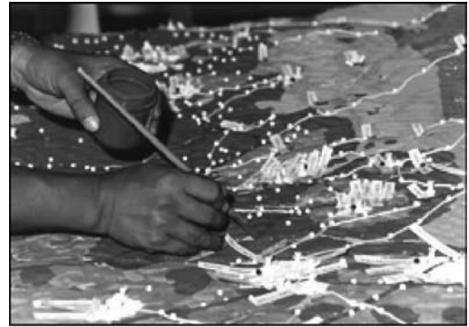
Figure 7. Villager Inputting Data on a 3D Model by the Use of Colour-coded Paint

Key informants/mapmakers: 98 community members including representatives from the Subanen Indigenous Communities, residents of all local administrative units (barangays), local government officials, Department of Environment and Natural Resources (DENR) and non-governmental organizations (NGO).