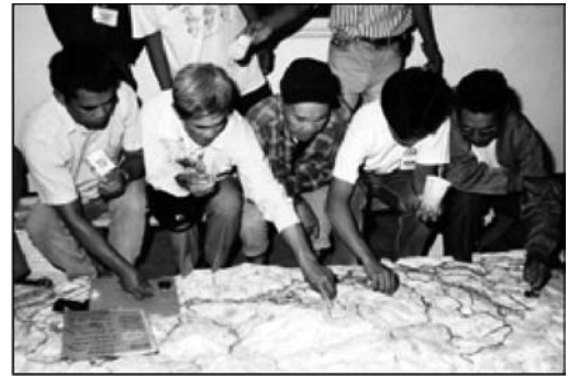
Figure 9. Village Elders Outlining Linear Features on a 3D Model in the Cordillera Administrative Region, Philippines, 1999

Proposed items were redefined, associated to clearly identifiable symbols. New items sprung up as the mapping process unfolded. These reflected deep-rooted community concerns and priorities. “Landslides” and “bare land” were singled out as important items to be depicted on the model.