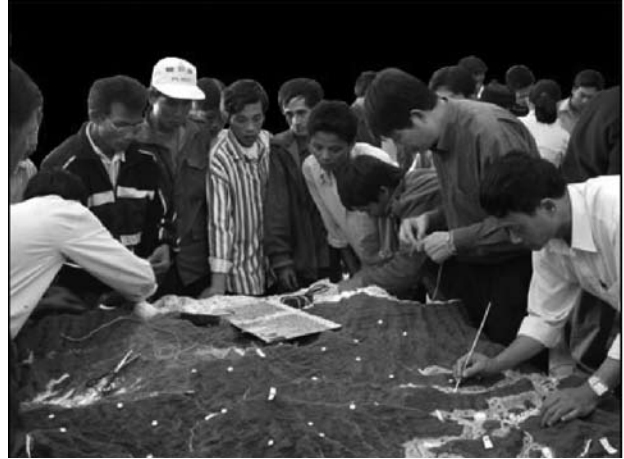
Figure 5. Hill Tribe People Discussing Legend Items during a P3DM Exercise, Pu Mat, Vietnam

Context issue: At the beginning of the activity informants were invited to review the draft legend, suggest changes, make integrations, and improve definitions (Figure 5).