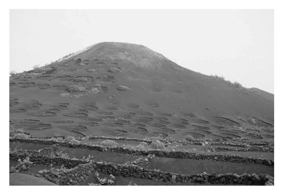
Figure 2. Volcano with vineyard, La Geria, Lanzarote