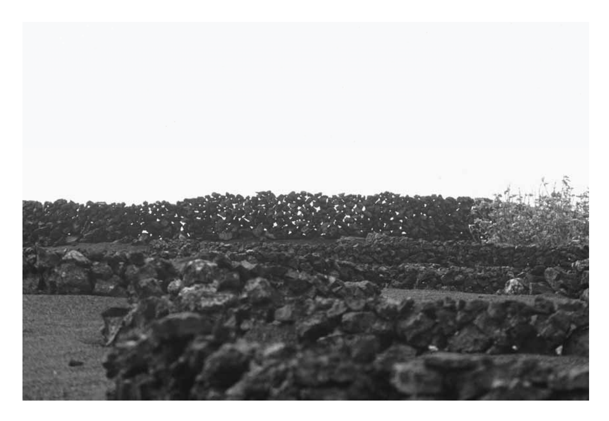
Figure 4. Dry stonewalls face the northeast to protect crops from the prevailing trade winds and are open to slow down the wind without causing turbulence (La Geria, Lanzarote)

All solar energy is concentrated in the pit and heats the volcanic ashes. During the night, these cool rapidly and as they are highly hygroscopic, they extract moisture from the air, which is concentrated in the pit with the plant. Each of the pits functions as a holon, an ecodevice at the micro-scale. Repeating this thousands of times creates a new cultural landscape with a distinct identity at the regional scale. This example also illustrates the interaction between natural conditions and processes and human creativity.