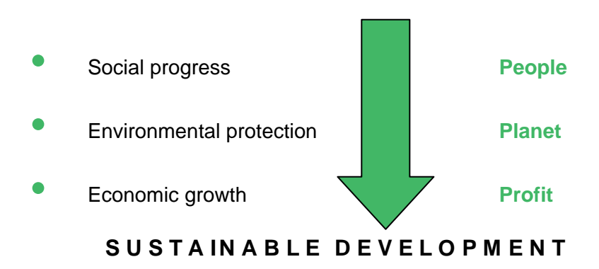
Figure 1. 'Triple bottom-line approach'

Through the 'triple bottom-line approach' (Figure 1), sourcing of required natural resources follows the Triple-P approach: work towards social progress of people, environmental protection of the planet, and economic growth or profit in the (developing) countries that supply us with the key raw materials.