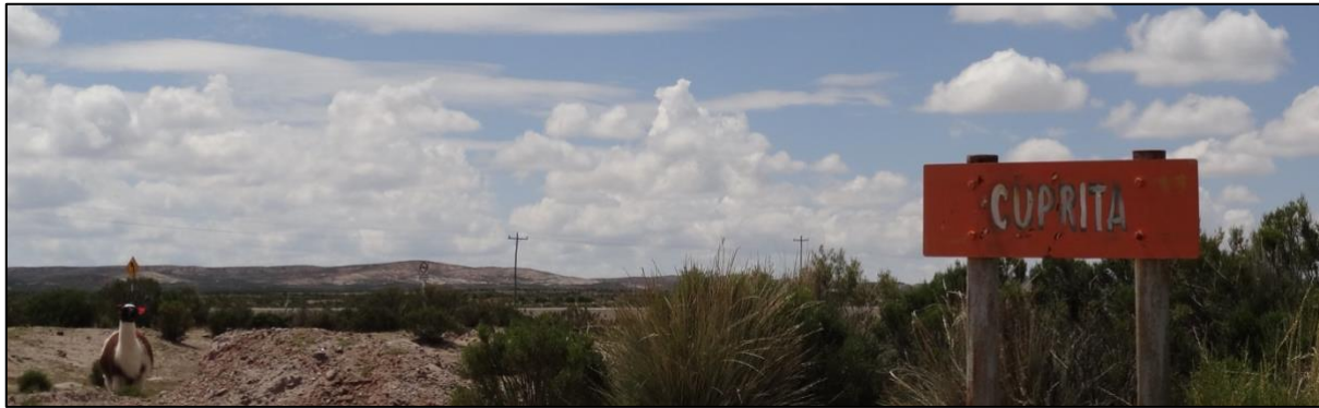
Llamas grazing behind the old signboard of the “Cuprita” copper mine, Bolivia.