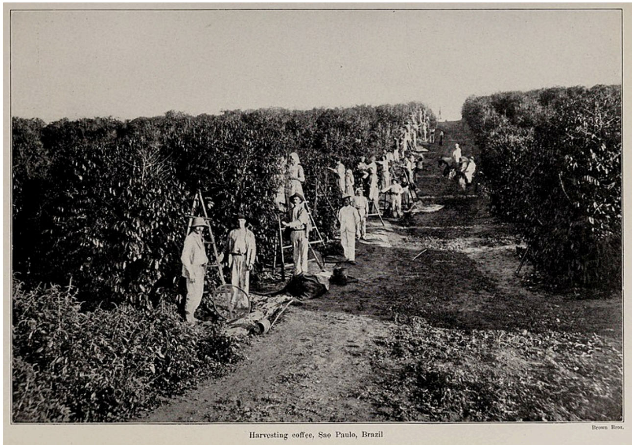
Harvesting coffee, Sao Paulo, Brazil. 1923.

Keywords: coffee, coca, gold, soy, sugar, tea, commodity frontiers