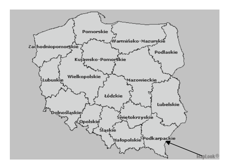
Figure 4. The 16 Voivodships of Poland.

Family care farms fit very well into the pro-ecological project approach because they can increase quality of life for certain groups of society and stimulate non-farming activities on farms, which is of great importance in this target area. Farming for health can be easily combined with the various nature protection activities and can help to sustain the traditional, old methods of food production or farming. Characteristics of the target area: Powiat Leżajsk is located in the south-eastern part of Poland and is divided into five gminas: town Leżajsk, gmina Leżajsk, gmina Nowa Sarzyna, gmina Grodzisko Dolne and gmina Kuryłówka (see Figures 4-6). The total surface area of the powiat is 583 km² with a population of 70,000 people.