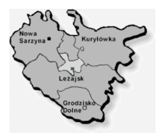
Figure 6. Leżajsk Powiat and its gminas

The indispensable strengths of the powiat are an unpolluted environment and a beautiful landscape that attracts many tourists. Here they find good places, especially for hunting, fishing in the river San, horse riding and hiking. Powiat Leżajsk generates attention also by organizing many festivals and celebrations every year. Examples are the International Festival for Organ and Chamber Music, and the Festival of Hunting.