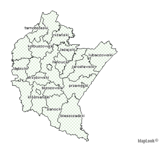
Figure 5. Podkarpackie Voivodship and its powiats