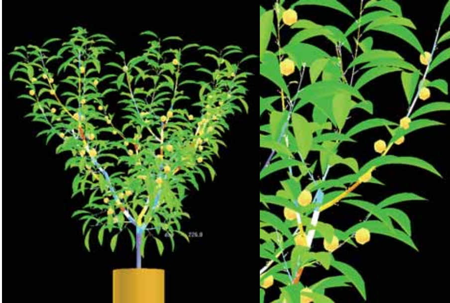
Figure 1. Examples of graphic outputs of L-PEACH. The tree on the left was generated by running the model to simulate growth into the fourth year. The tree was trained to the ‘open vase’ shape by repetitive pruning in the ‘winter’ of each year. Fruit was also selectively thinned early in each fruit growth season. The close-up on the right indicates outcomes of modelled source–sink behaviour on fruit size. Note that fruit size on lightly cropped branches is larger than on the branch with a heavy crop load

To model responses to water stress, the user can specify the soil volume available for root exploration, an irrigation (or rainfall) interval for replenishing soil water, and the relative sensitivities of each organ type to water stress (represented by function f_c in the stem elongation sink and its equivalents in other sinks). During the simulation, water demand is calculated based on the cumulative leaf exposure to light, and the sink strength of each organ is modified in response to the developing water shortage within the plant. Thus the differential effects of a developing water stress on root, shoot and fruit growth, as well as on carbon assimilation and partitioning, can be simulated without any empirical rules governing allometry between plant parts.