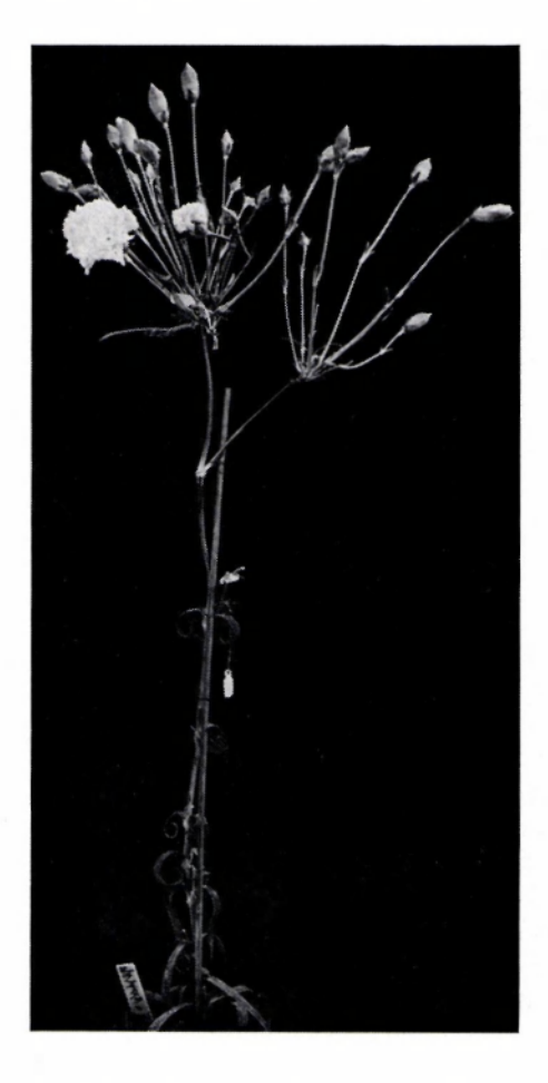
Fig. 3. Shoots reproducing the original stage of ontogenesis of the stock plant top. The shoots developed from the uppermost internodes of a stock plant which was bolting at the time of decapitation.

tween the mean numbers of plantlets per annular zone.