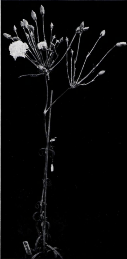
Fig. 3. Shoots reproducing the original stage of ontogenesis of the stock plant top. The shoots developed from the uppermost internodes of a stock plant which was bolting at the time of decapitation.

tween the mean numbers of plantlets per annular zone.